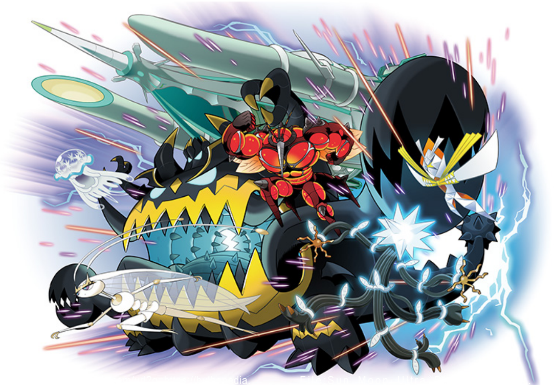
Ultra Beasts from Pokémon Sun and Moon

and video games have not yet occurred. However, the characters of these regions certainly still exist and could be written to in back rooms or possibly appear in crisis updates. Also, even though Pokémon is a generally light hearted franchise, there is still the occasional character death. So don't feel afraid to write anything of this nature in back rooms in fear that it won't fit the setting.